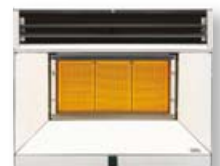
Available in Natural Gas

Input: 25MJ, 7.0 kW Width: 505mm Height: 359mm Depth: 419mm Weight: 10kg