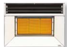
Available in Natural Gas & LPG

Input: 24MJ, 7.0kw Width: 505mm Height: 332mm Depth: 417mm Weight: 10kg